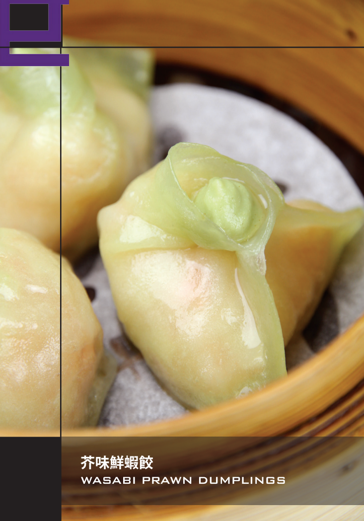
芥味鮮蝦餃 WASABI PRAWN DUMPLINGS