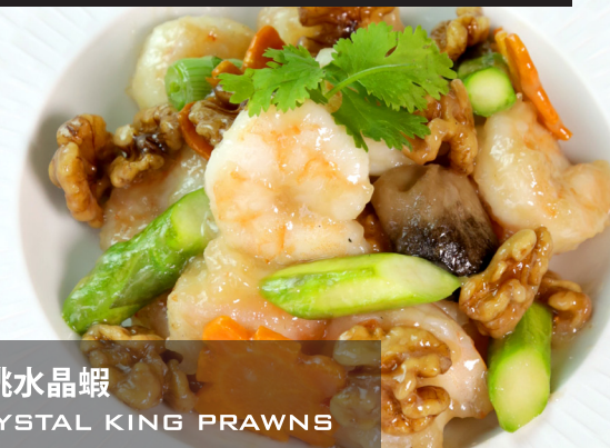
合桃水晶蝦 CRYSTAL KING PRAWNS WITH WALNUT

SAUTÉED RAZOR CLAMS, GARLIC SHOOT WITH SHRIMP SAUCE £26