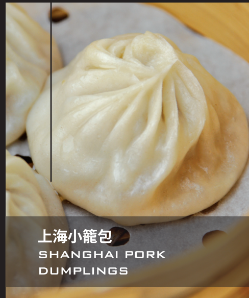
上海小籠包 SHANGHAI PORK DUMPLINGS