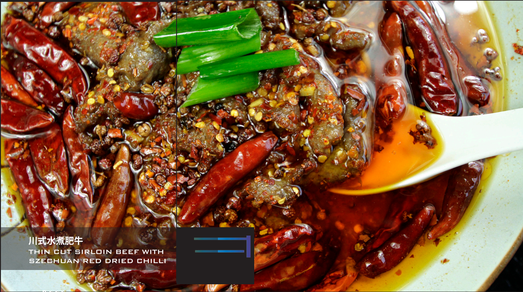
川式水煮肥牛 THIN CUT SIRLOIN BEEF WITH SZECHUAN RED DRIED CHILLI