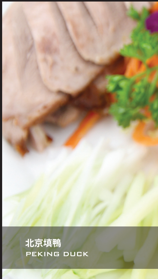
北京填鴨 PEKING DUCK