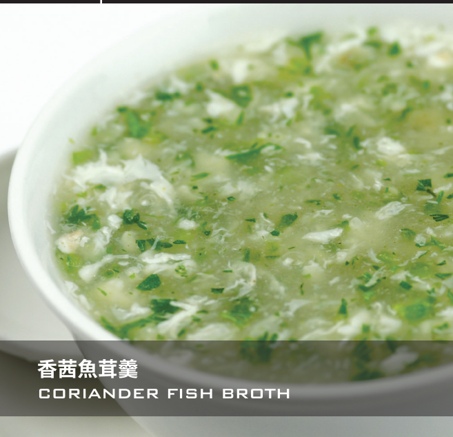
香茜魚茸羹 CORIANDER FISH BROTH