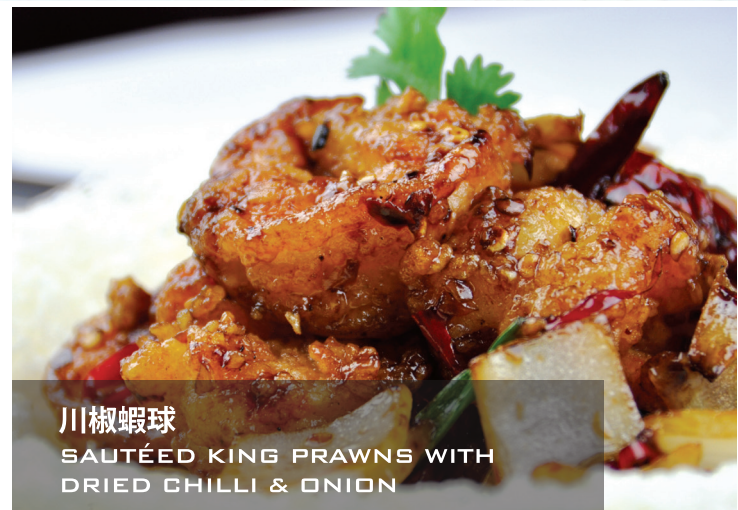
川椒蝦球 SAUTÉED KING PRAWNS WITH DRIED CHILLI & ONION

OPTIONAL 12.5% SERVICE CHARGE WILL BE ADDED TO YOUR BILL. PLEASE NOTIFY OUR STAFF FOR ANY ALLEGIES.